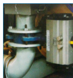
Pneumatic Inlet/Outlet Water/Steam Actuators

Note:- Specification are subject to change without prior notice.