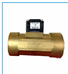
Flow Control Valve