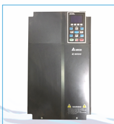
Variable Frequency Drive