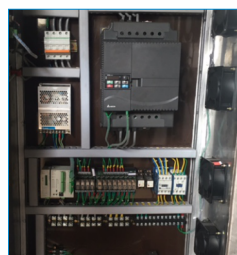
Main Electrical Panel